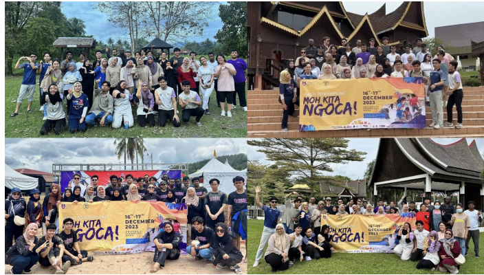
Back to Kampung: Moh Kita Ngoca!

series of cherished moments spent with friends from different corners of the globe. These moments of exploration, shared with friends from various countries, mark some of the best times of my life.