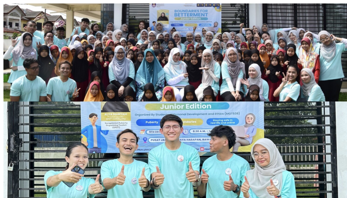
Boundaries for Betterment Program

A pivotal chapter in this experience was my role as the Multimedia Coordinator for the impactful community service project titled "Boundaries of Betterment." Steering the narrative, we educated children in an orphanage about gender boundaries, emphasizing online and offline safety as a muslims. As the multimedia coordinator, I orchestrated the design and publicity facets, contributing to the success of this impactful initiative.