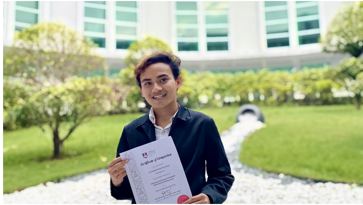
International Exchange Program at MARA Technology University (UiTM) Malaysia